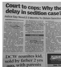
Figure 2. A newspaper cutting from The Times of India.